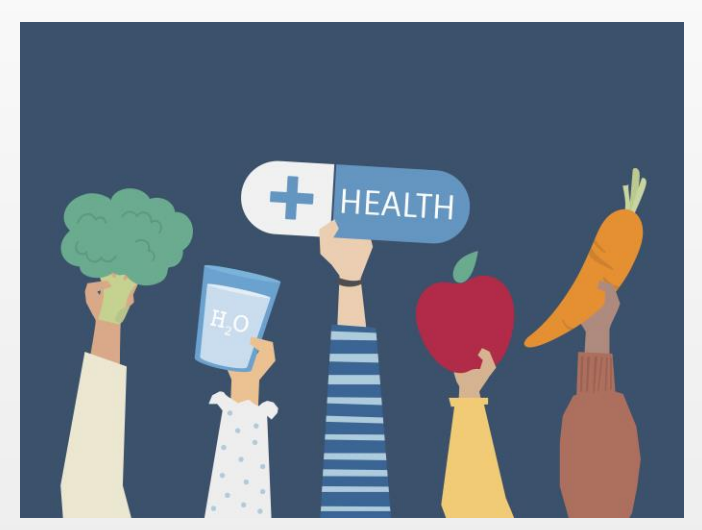
<a href="https://www.freepik.com/vectors/background">Background vector created by rawpixel.com - www.freepik.com</a>