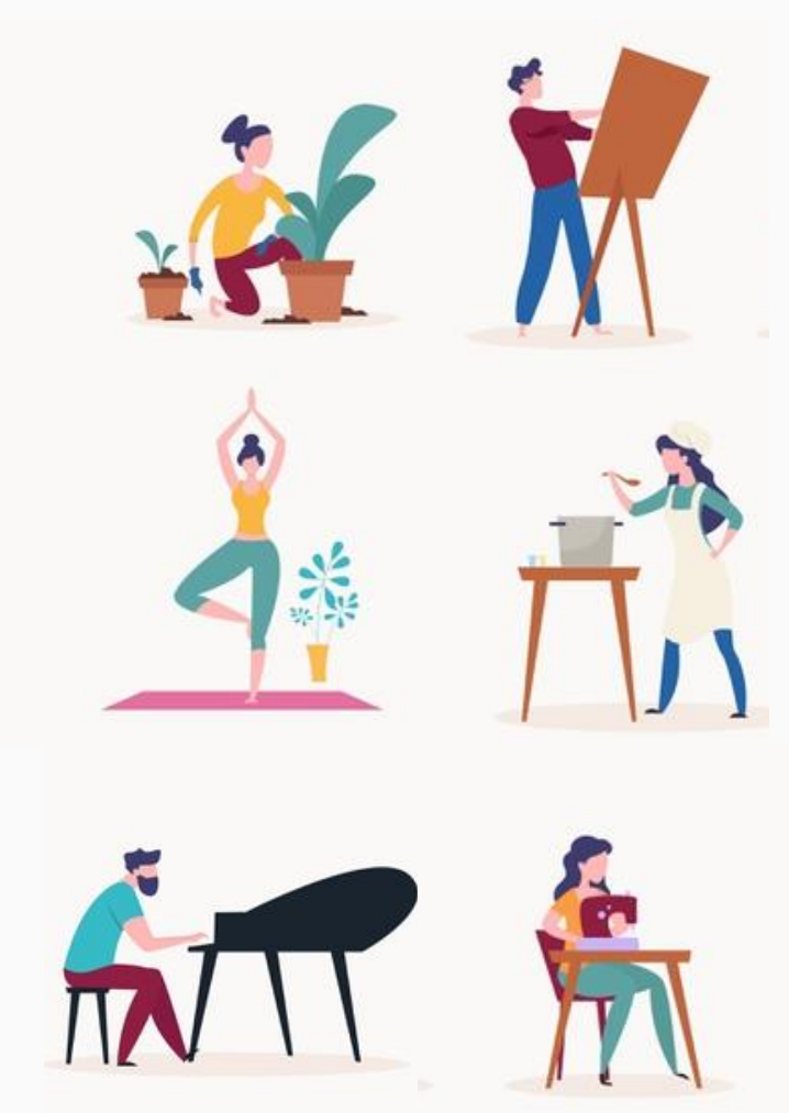
<a href="https://www.freepik.com/vectors/people">People vector created by pikisuperstar www.freepik.com</a>