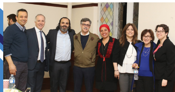
Ifar with Temple Emanu-El-Beth Shalom and the Muslim Association of Canada welcomed 130 guests at St. James United in May 2019