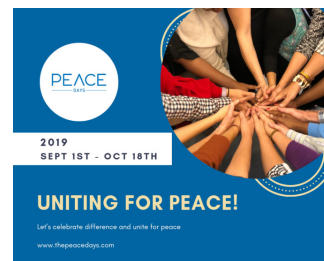
A joint MCM and St. James United panel discussion for Peace Day: A Call to Community in a Changing World