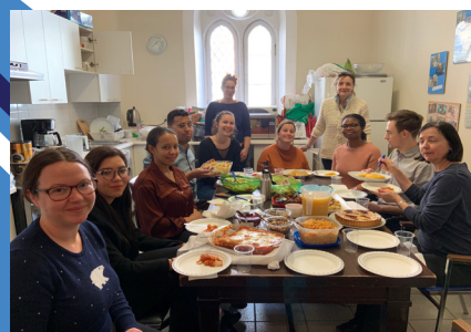
End of term potluck in December 2019