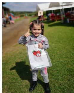
300+ at 2019 Apple Picking Outing! A record!