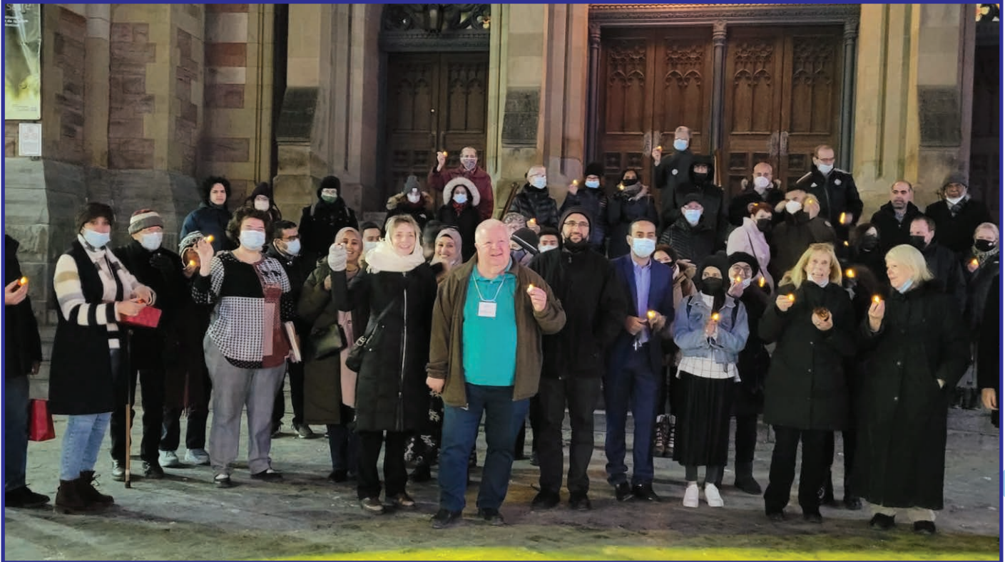
A United Church of Canada Community Ministry

Montreal City Mission communautaire de Montréal