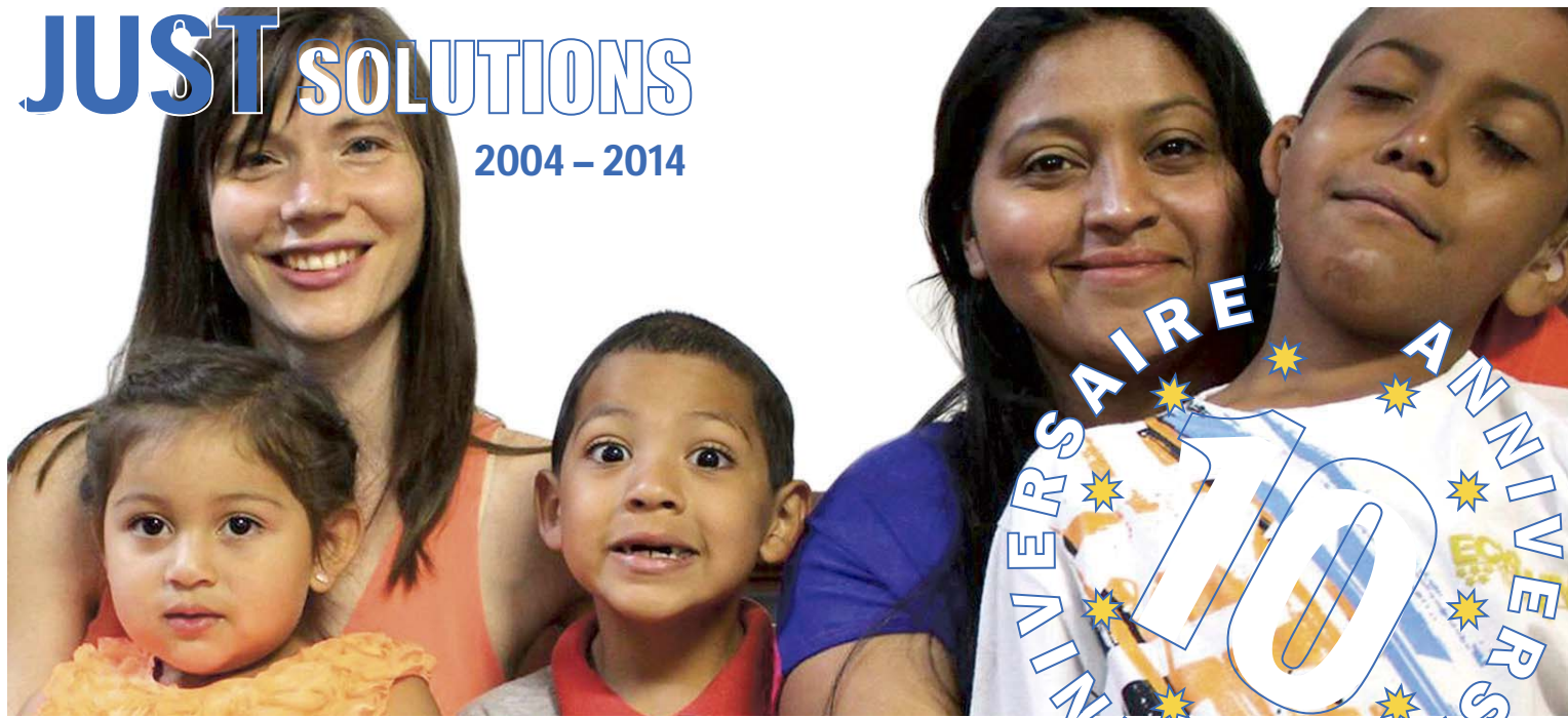
Celebrating 10 years of access to justice for vulnerable migrants

In the early 2000s, men, women and children were falling through the cracks of our refugee system due to poor or no legal assistance. MCM responded by establishing the Just Solutions Legal Clinic to provide accessible, quality legal services as well as moral support and accompaniment. Ten years later, Just Solutions remains the only specialized community legal service in Quebec.